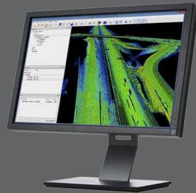
MAGNET Office with Resurfacing