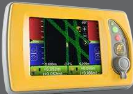
GX-60 Control Box