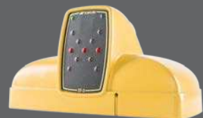
ST-3 Sonic Tracker