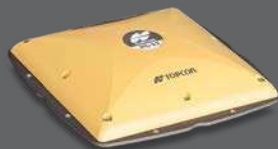
PG-S3 GNSS Antenna