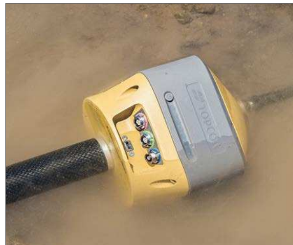
IP67 Waterproof Rating

Awkward shots on steep slopes or hard to reach spots are now a breeze with TILT™.